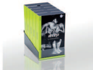
Sportswear display WW80069 mountable for 5 units W 19,1 x D 30,5 cm, 25€