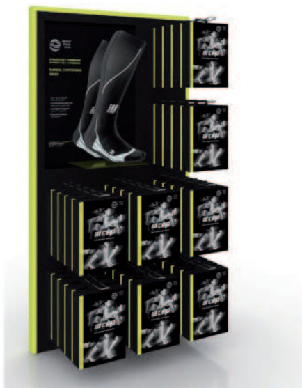
POS module 1 WW80009 W 62,5 x H 119,5 cm, 250€