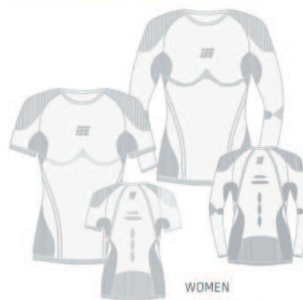
WOMEN available in white and black