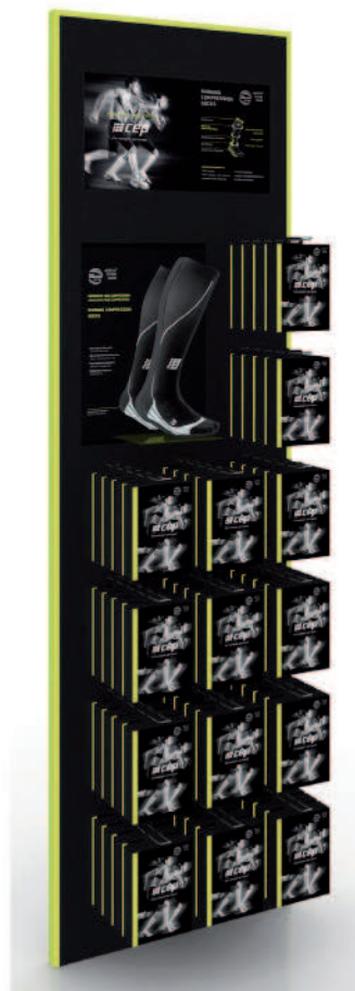
POS module 2 WW80013 W 62,5 x H 250 cm, 345€