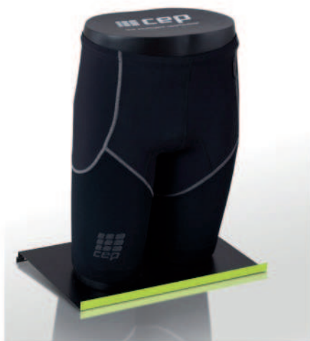
Shorts torso man WW80066 H 50 cm, 110€ Shelf panel for torso WW80067 W 43 x D 30 cm, 25€