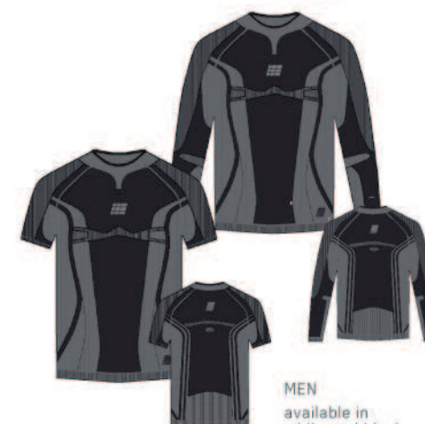
MEN available in white and black