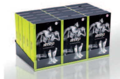
Sportswear display WW80068 mountable for 15 units W 57 x D 30,5 cm, 45€